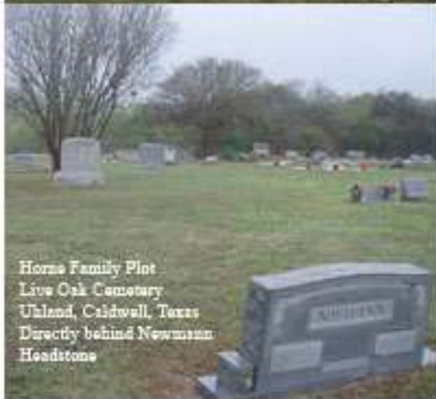
Horne Family Plot Live Oak Cemetery Umland, Caldwell, Texas Directly behind Newmann Headstone