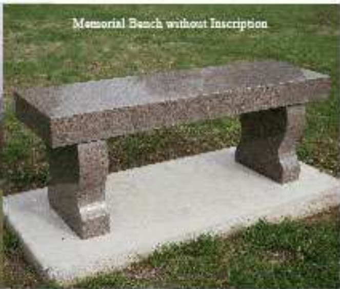
Memorial Bench without Inscription