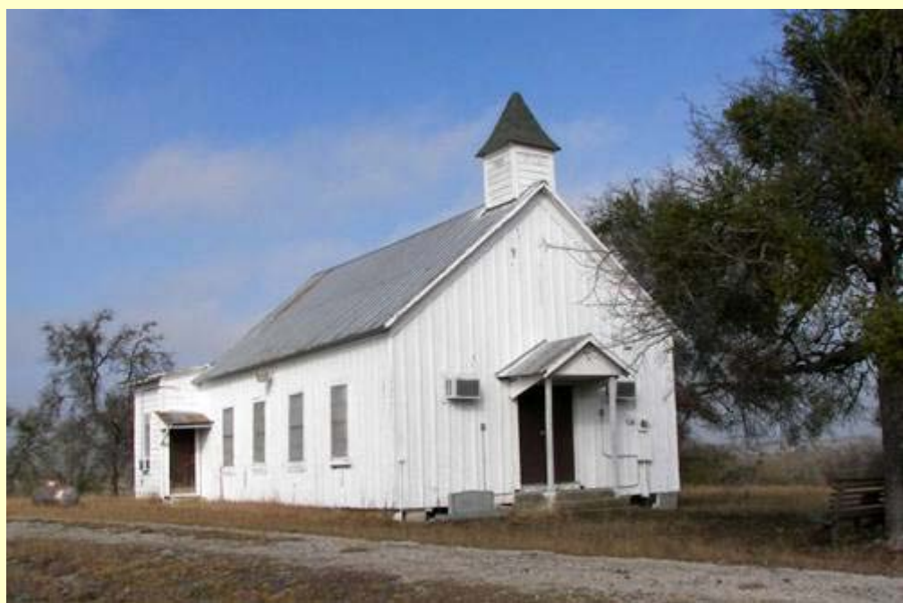
Clearview Baptist Church (just South of Fentress) December 2006