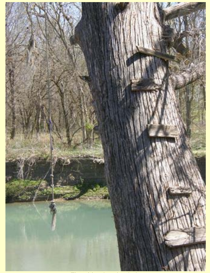
The old swimming hole TE photo, March 2008