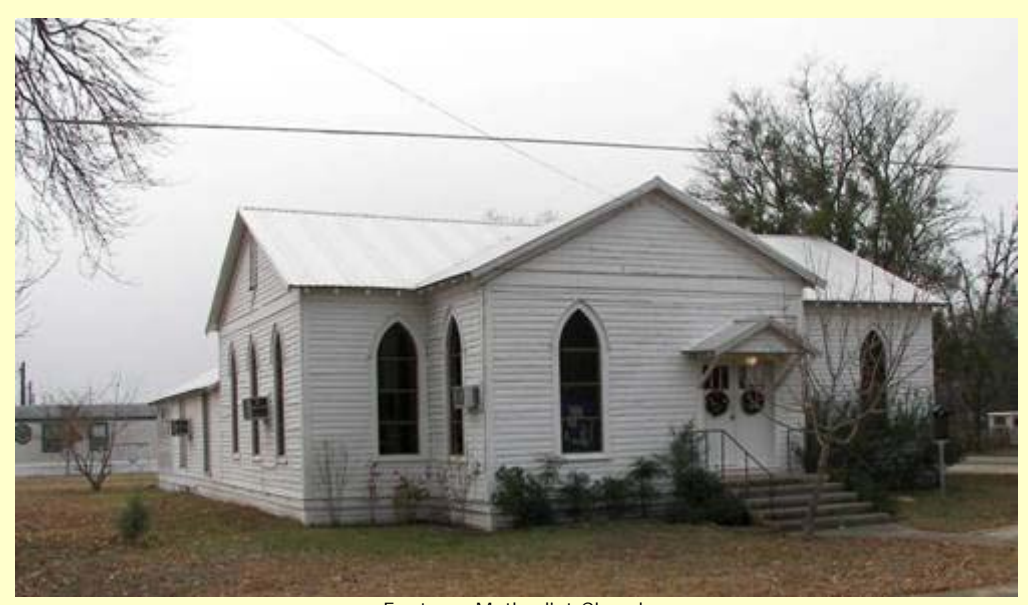
Fentress Methodist Church December 2006

The population was reported as 85 in 1990 and has since increased to 291 for the 2000 census.