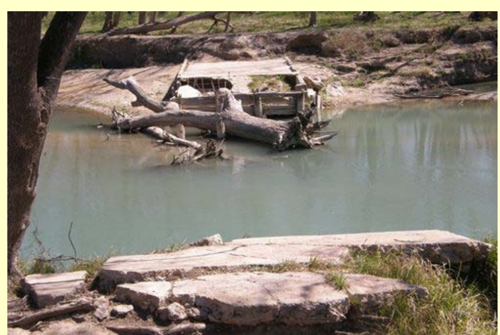
Remains of the old low-water crossing over the San Marcos River March 2008