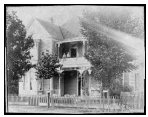
McCurdy Home - circa 1903 305 Prairie Street

establish churches and build their sanctuaries. His early training in carpentry and construction gave him unusual talents in these activities.