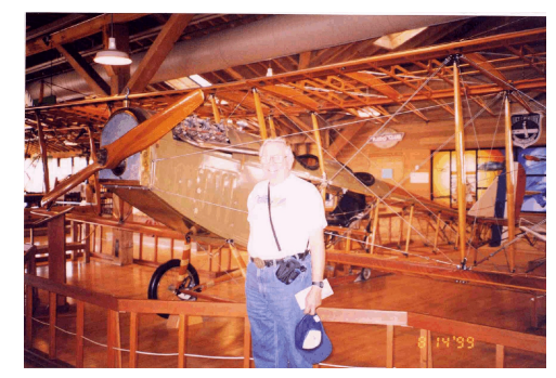
Curtis JN-4 Jenny Boeing Flight Museum